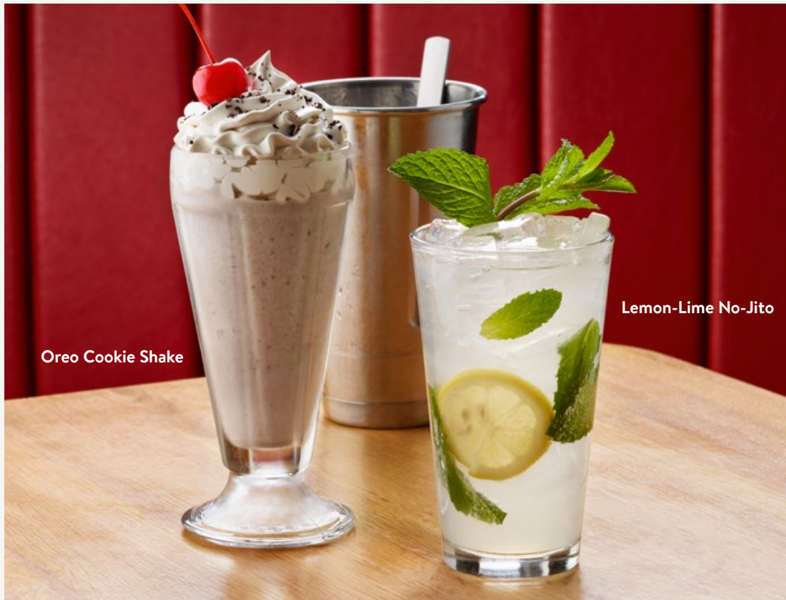
Oreo Cookie Shake